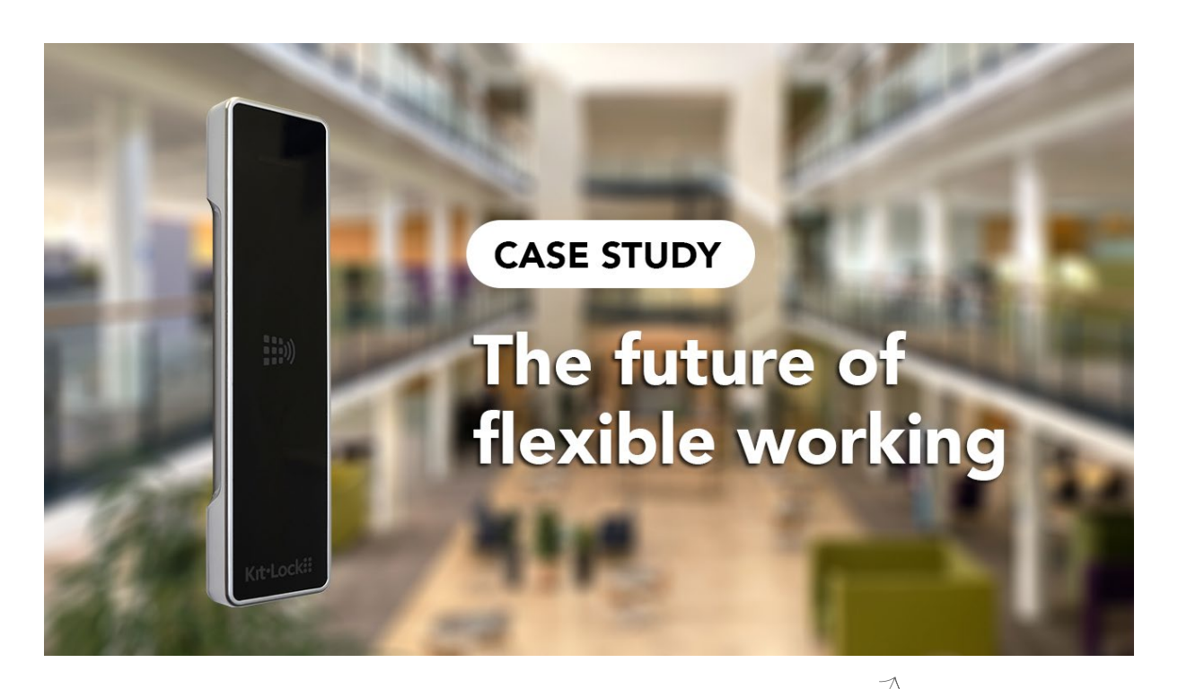
Click the image above to watch the video!